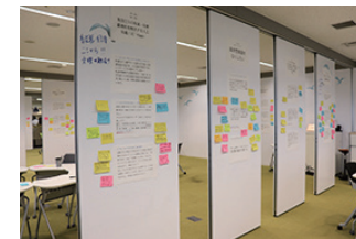
Matching event gathered tens of research seeds and comments