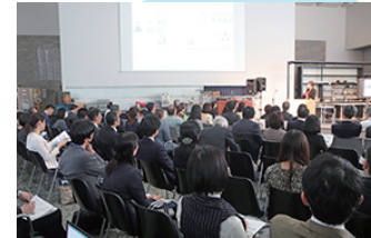
Kickoff symposium hosted 100 participants mostly from industries