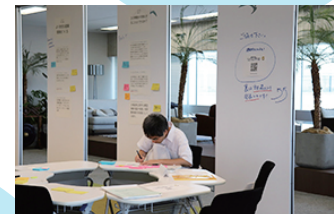
Matching event inspired creative thinking