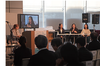
Kickoff symposium was featured by a TV program