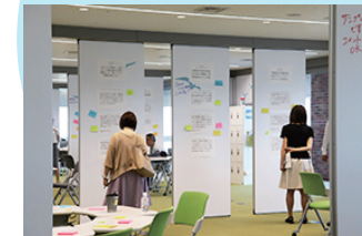
Matching event welcomed 130 guests from variety of fields in a day