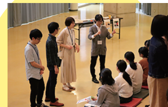
Extension lecture for highschool students