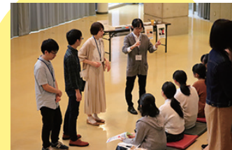
Extension lecture for highschool students