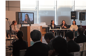
Kickoff symposium was featured by a TV program