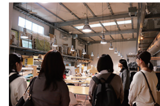
Campus tour for fostering next generations