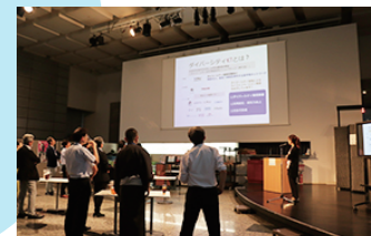
Diversity networking made an impact in summer 2019