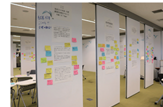
Matching event gathered tens of research seeds and comments