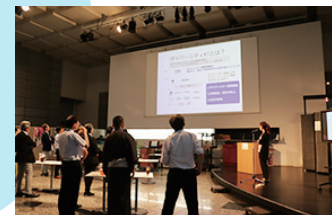
Diversity networking made an impact in summer 2019